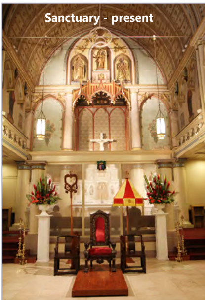
Sanctuary - present

Now we need your help to raise the funds needed to complete the project. The goal of the Cathedral Renewal Campaign is to raise a minimum of $15 million to fund all the remaining project phases. New gifts and pledges will support Phases 3-6, which will include future improvements such as: construction of the Reliquary Chapel, renovations to the interior of the church, new immersion baptismal font, new furnishings, new and restored artwork, new tile floors, new lighting, new audio/video system, upgrades to electrical and mechanical systems; and, complete restoration of the vaulted ceilings, stained glass windows and the pipe organ, as well as exterior painting and landscaping.