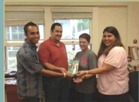
Renewing the Vision