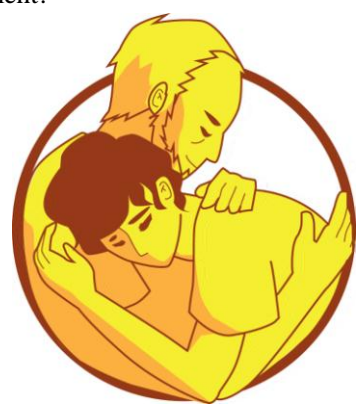
"You are with me always. And all I have is yours." Luke 15:31

If so, know that the love of God is able to find a space in your heart, especially through this sacrament!