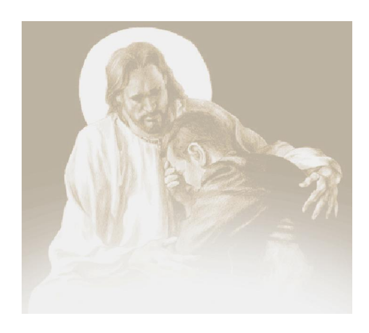
"The Church is a Hospital for Sinners." ~Pope Francis